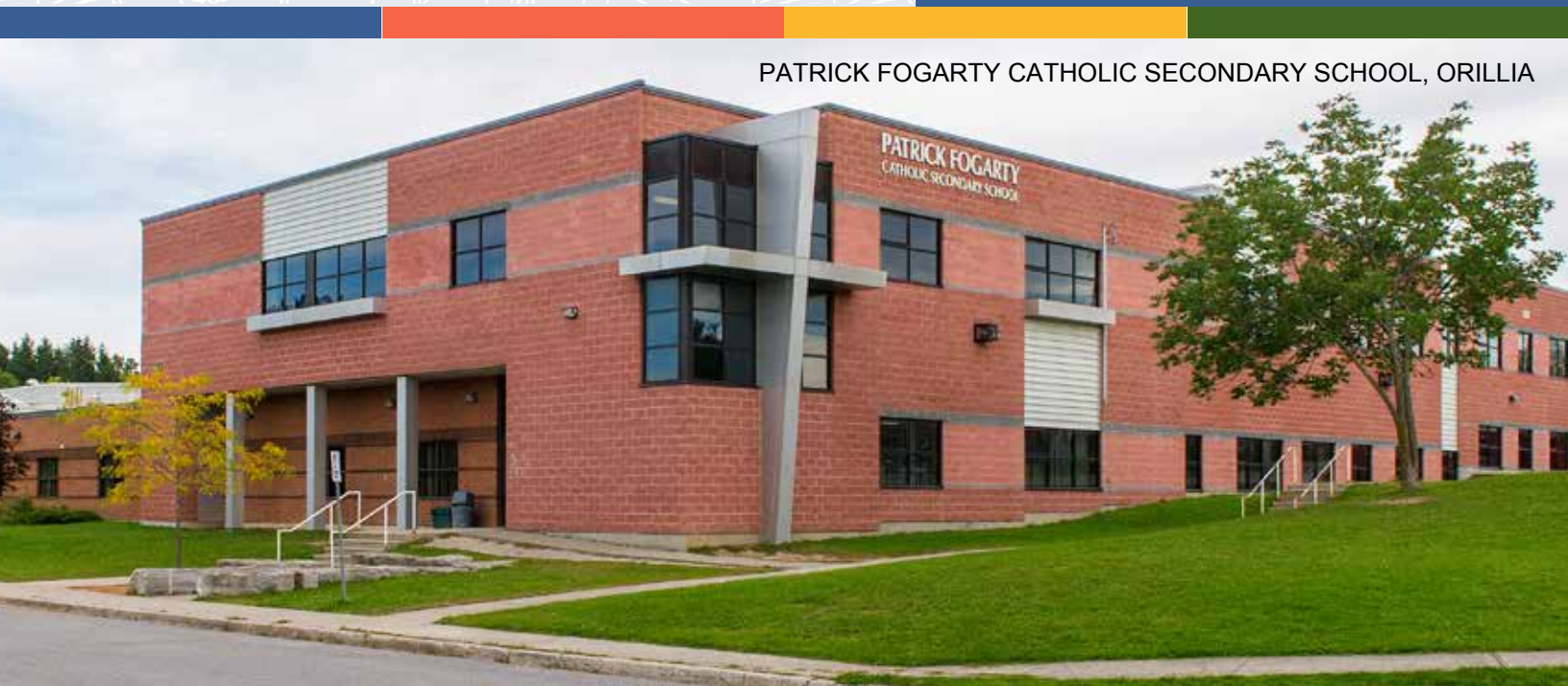
PATRICK FOGARTY CATHOLIC SECONDARY SCHOOL, ORILLIA