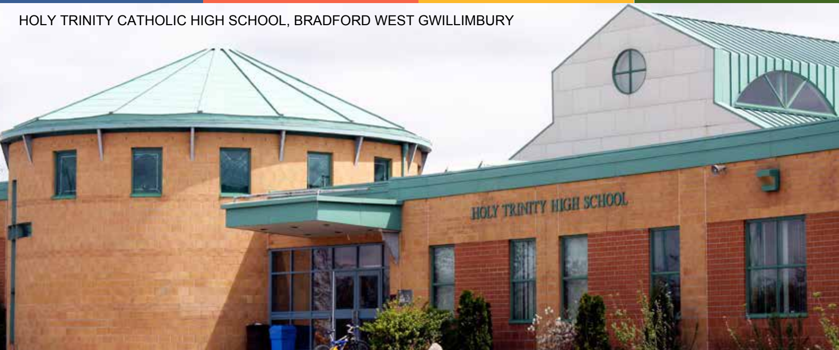
HOLY TRINITY CATHOLIC HIGH SCHOOL, BRADFORD WEST GWILLIMBURY

Note: If your child has special education needs and currently has modified and/or alternative programming, courses should be selected with the support of the school team. Please schedule a transition meeting with the secondary school-based team.