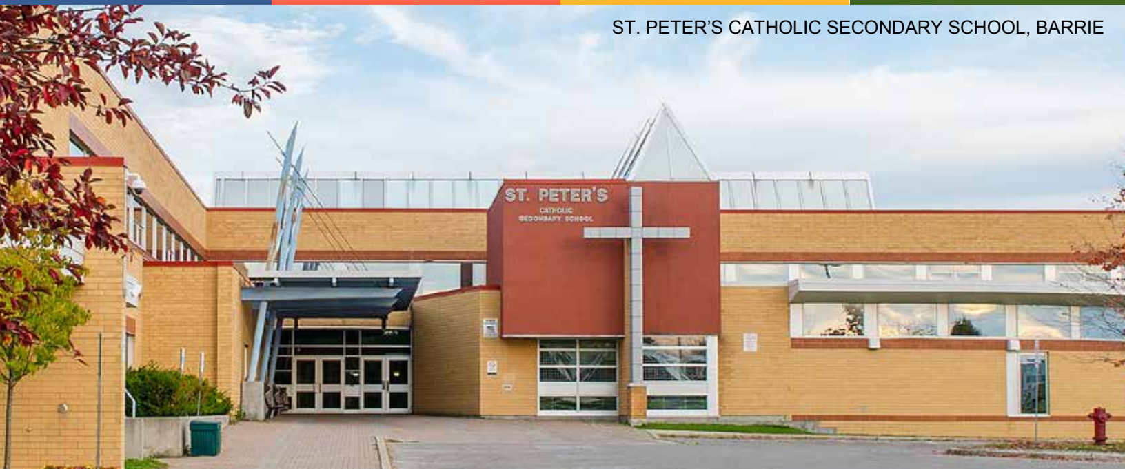
ST. PETER'S CATHOLIC SECONDARY SCHOOL, BARRIE