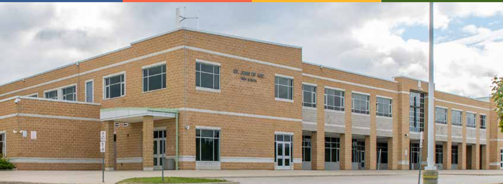
ST. JOAN OF ARC CATHOLIC HIGH SCHOOL, BARRIE

Both the Certificate of Education and the Certificate of Accomplishment recognize achievements and can be used for students who plan to take certain vocational programs, training or who plan to find employment after leaving school.