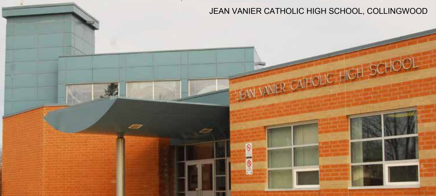
JEAN VANIER CATHOLIC HIGH SCHOOL, COLLINGWOOD

Students in Grade 11 & 12 can withdraw from a course 5 days after mid-term reports are distributed without it appearing on their transcript. Withdrawing from a course after that date means that the mid-term mark will appear on the student transcript.